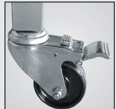
Stainless Steel Casters with Locks