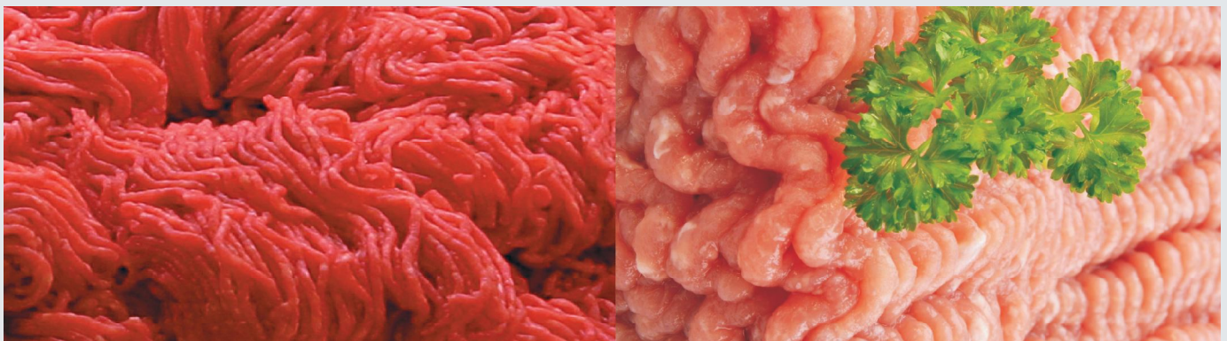
Visually appealing & Long Shelf Life Mince without preservatives