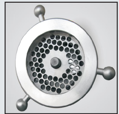
42 Size Cutting Head with 42 Size Worm