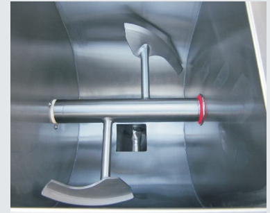
Polished Tub & Mixing Paddle Removable Stainless Steel Paddle

Hall Mincer Mixers complies with FSANZ, HACCP standards and is AS/NZS & AQIS Certified.