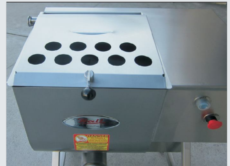
Stainless Steel Lid with Safety Interlock

Contact us for a list of un-biased Hall Equipment users in your region/state.